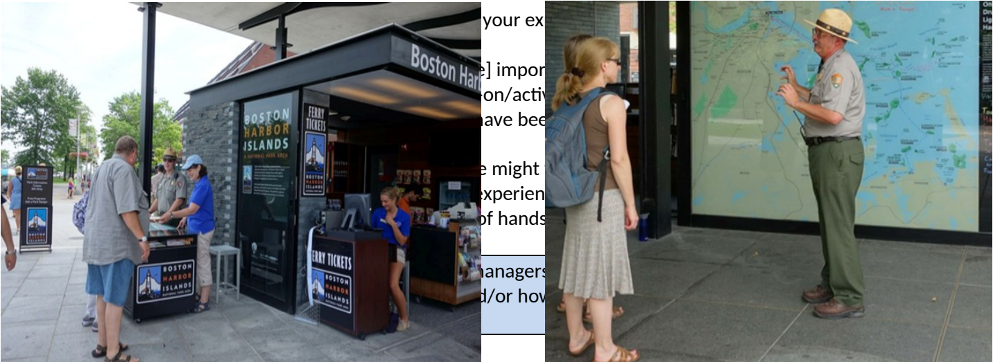
Now I am going to ask you about some of the activities you engaged in while visiting [this site]. Probe 1: Please tell me about some of the ways you experienced self-discovery while onsite. Probe 2: Was there anything at this site that resonated with who you are? Was there anything

<u>used in section 3 above</u>, the interviewer will pick one of the three photos selected and continue the questioning.)