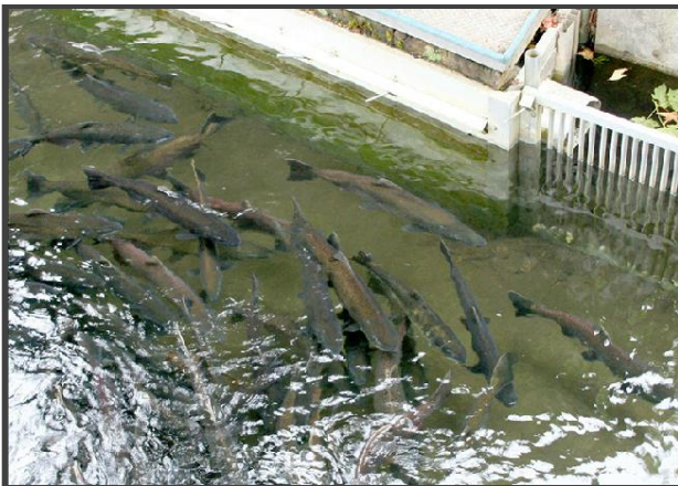
Hatchery spring Chinook salmon at Willamette hatchery in Oakridge, Oregon