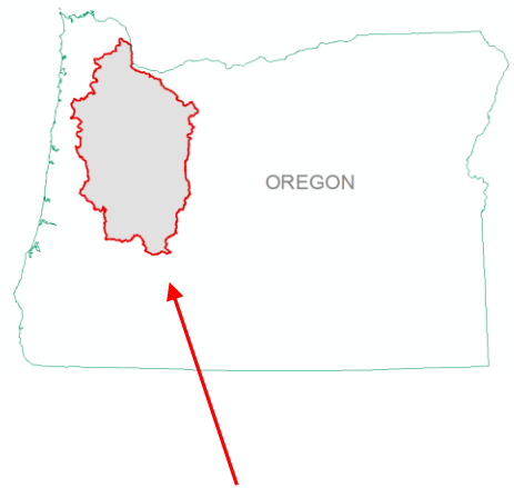
Willamette watershed boundary