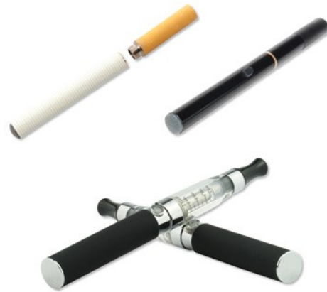
Image 2. Electronic cigarettes

C14. Have you used chewing tobacco, snus, snuff, or dip, at least 20 times in your entire life? Some popular brands include Redman, Levi Garrett, Beechnut, Skoal or Copenhagen.