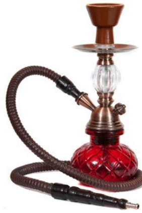
Image 1. Hookah/water pipe

C13. Which of the following tobacco products have you ever tried even once?