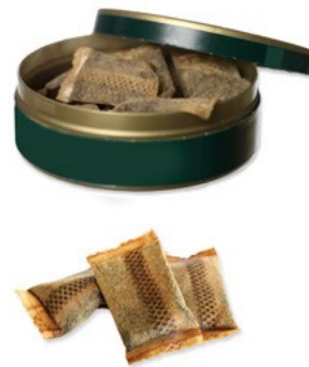
Image 3. Snus