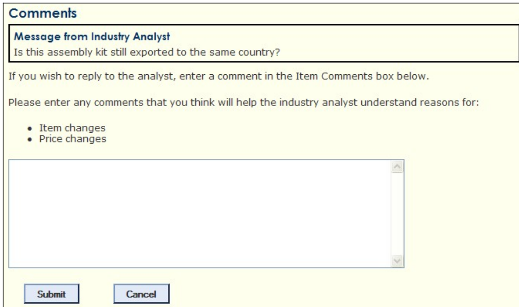
Message from Industry Analyst Screen