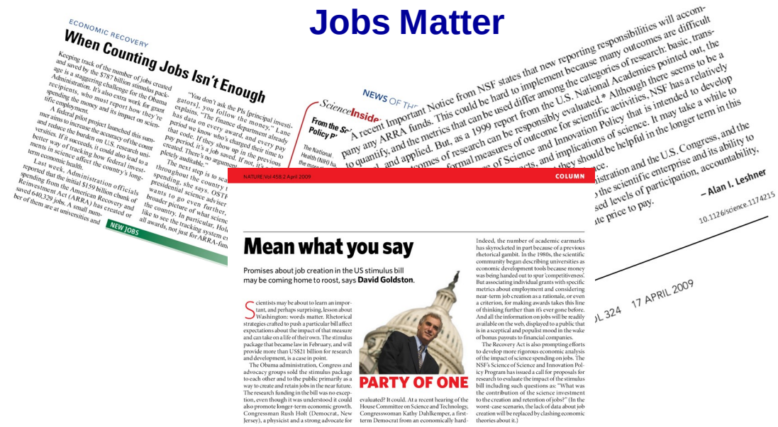
Figure 1: Articles in Science and Nature on science job creation

Use of the data The administration has committed to producing an open, transparent and auditable set of reports of the impact of ARRA on job creation. In addition, as noted in Figure 1, the media has asked important questions about the impact of federal investments in science, particularly with respect to job creation and economic growth. It is important to collect and analyze data so that such questions can be answered in a credible fashion. There is currently no data infrastructure that systematically couples science funding with outcomes.