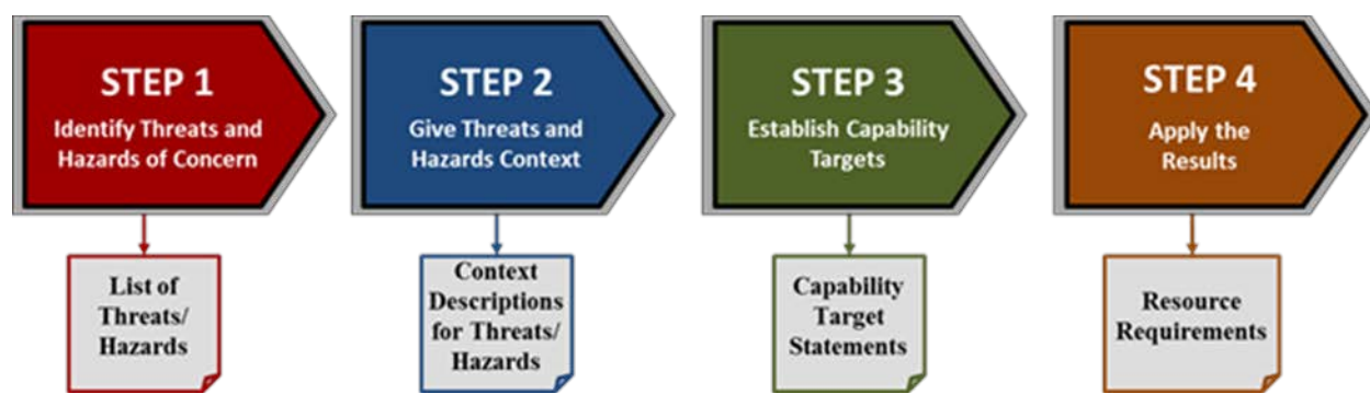
Figure 2-1: The THIRA Process

The THIRA and SPR are complementary and interconnected. Jurisdictions use the THIRA to identify core capability resource requirements and the SPR to assess their internal and mutual aid capability relative to those requirements. As such, jurisdictions must first use the THIRA to identify capability targets before they can use the SPR. The URT serves as the data collection mechanism for the THIRA and SPR assessments. Figure 2-1 shows the four steps of the THIRA process.