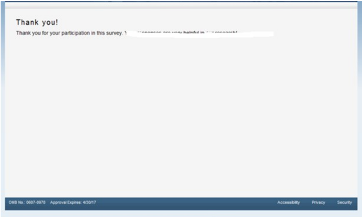
Figure 10: Thank you screen after submitting (Version 1 and 2.)