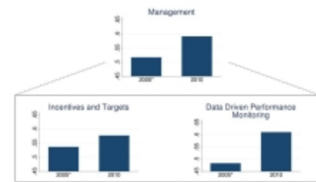
Figure 3: Average management scores have increased between 2005 and 2010, especially for data driven performance monitoring

* Based on recall. When surveyed in 2010, respondents were asked about 2005.