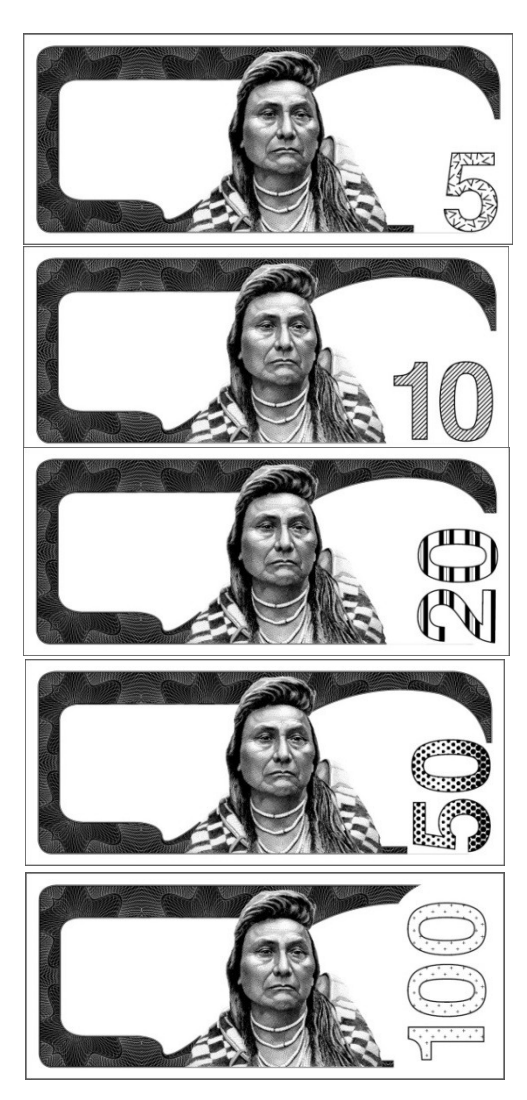
Figure 3 . The configurations of the numerals on the coupons