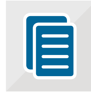
Spouse's citizenship documents

The other documents you need will depend on the information you enter in the form (such as your personal history, family, and circumstances).