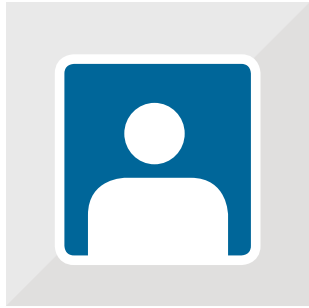
2 inch by 2 inch photo

Before you start the Application for Naturalization (Form N-400), you may want to gather the documents you will need to support your application.