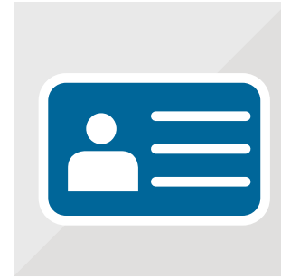
Permanent Resident Card