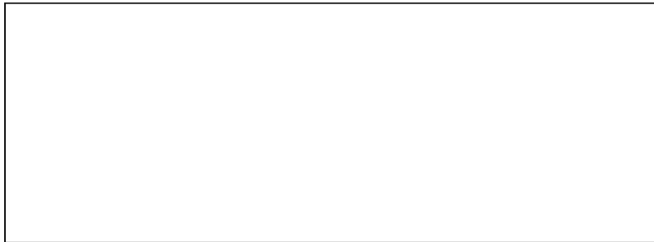
Figure 2: PSAPs with Physically Diverse Critical 911 Circuits

Please list all the PSAPs with physically diverse critical 911 circuits in the following textbox. Please provide the list the following way: PSAP1, StateAbbreviation1; PSAP2, StateAbbreviation2; etc.