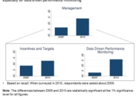
Figure 3: Average management scores have increased between 2005 and 2010, especially for data driven performance monitoring