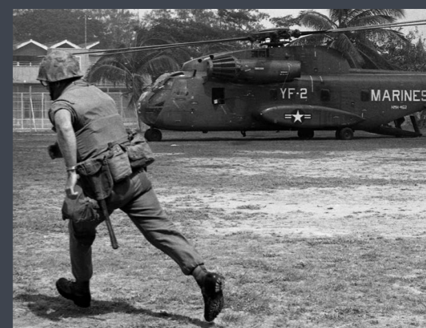
A U.S. Marine runs to secure the perimeter at Landing Zone Hotel during operation Eagle Pull in Phnom Penh, Cambodia, April 12, 1975.

DoD personnel aware of physical imagery should go to http://www.dimoc.mil/quick/physicalimagery.html for more information on transferring the assets to DIMOC.