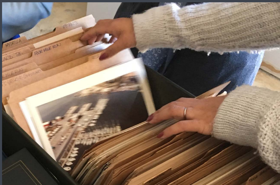
Employees of the U.S. Army Corps of Engineers review historic photographs in Baltimore Jan. 28, 2017.