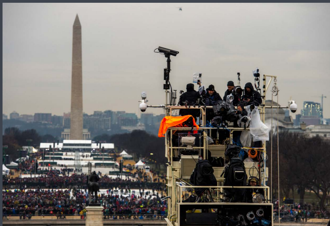
Members of the media prepare for the 58th Presidential Inauguration in Washington, D.C., Jan. 20, 2017. More than 5,000 military personnel from across all branches of the armed forces of the United States, including reserve and National Guard components, provided ceremonial support and Defense Support of Civil Authorities during the inaugural period.

For more information on how the JCCC can assist your unit with an upcoming operation or exercise, email jccc@mail.mil or call 301-222-6273.