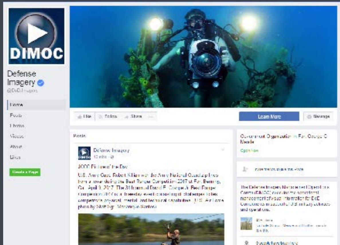
Screenshot of the Defense Imagery Facebook page.

Drop by, share with us, like and follow us, and join the discussion!