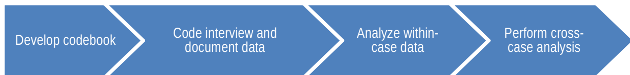
Exhibit 4. Overview of Qualitative Analysis Process

standards to limit bias and ensure reliable findings. These procedures are part of a four-step analytic process, illustrated in Exhibit 4, guided by the study questions and conceptual framework. Each step is described in more detail in the text that follows.