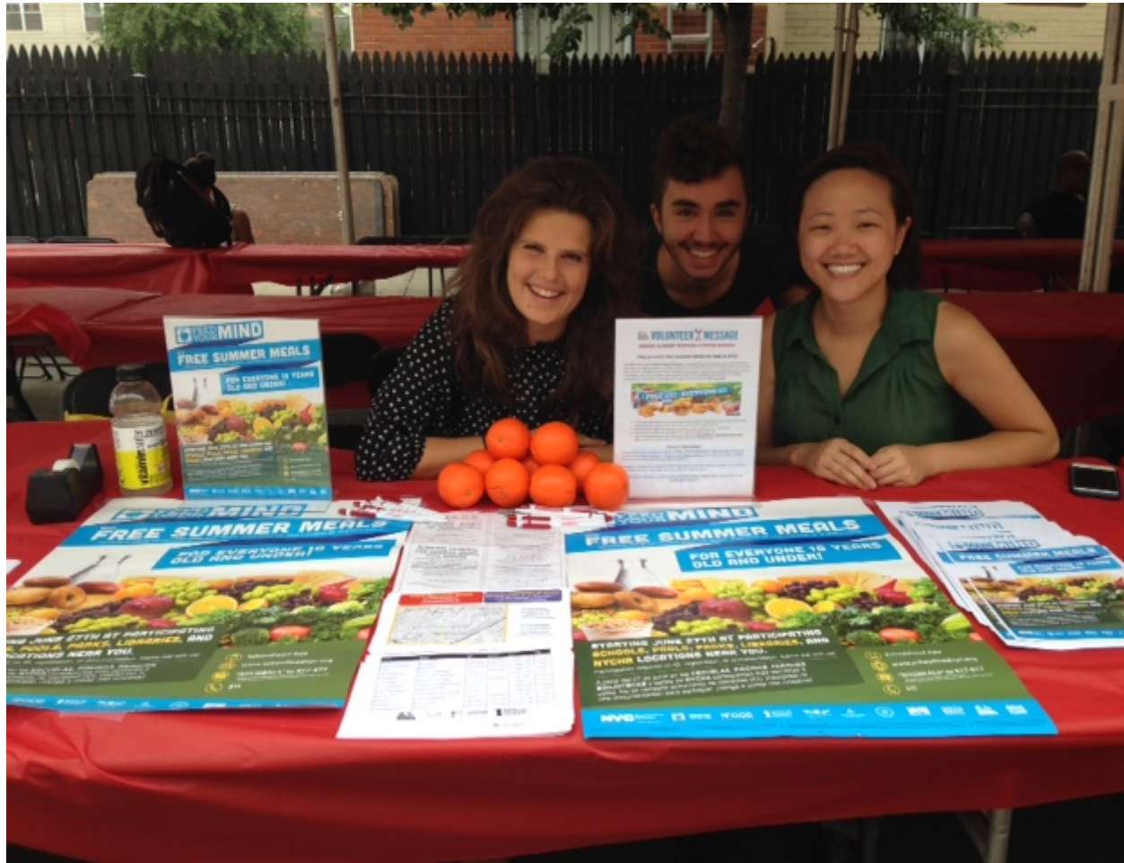
VISTAS conducting outreach in New York City, July 2015.