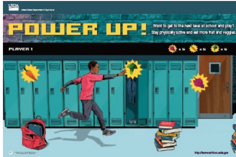
Poster Concept 1: Power Up – A