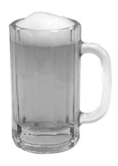
1 Regular Beer 12 oz.