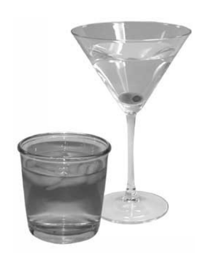
1 Shot of Liquor (Whisky, Vodka, Gin, etc.) 1.5 oz.