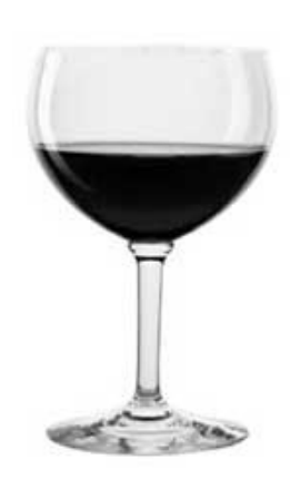
1 Glass of Wine 5 oz.