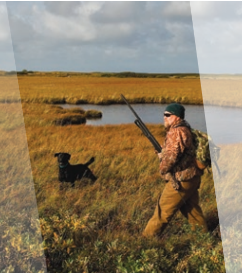
Healthy lands support diverse wildlife populations for wildlife watchers, anglers and hunters.