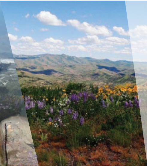
Spring Beauty at Sunflower Flats, Elko District BLM Nevada. SHANELL OWEN