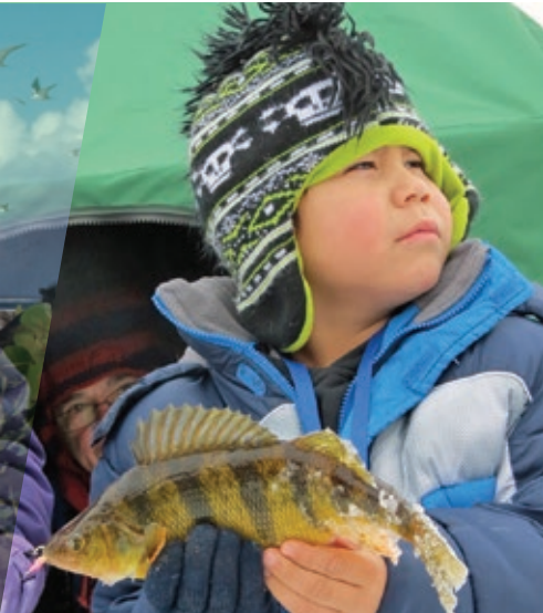
Child with fish at the Upper Mississippi River National Wildlife Refuge.

Traditional ecological knowledge 4 refers to the knowledge, innovations, and practices of indigenous and local communities around the world.