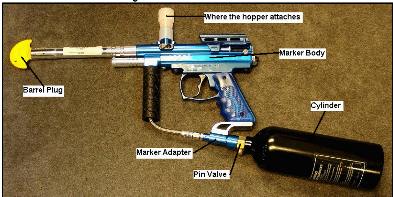
Figure 1: Paintball Marker

A common hazard pattern is intentional or accidental firing of a paintball into a body part (usually face or eye). Paintball markers are activated by a trigger much like BB-guns. A paintball marker consists of the marker body (which looks like a gun), a cylinder (which contains compressed gas for propelling the paintball pellets), and a hopper (which acts as a magazine for holding the paintball pellets) (see Figure 1).