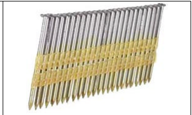
Figure 3. Strip of full round head nails.

There are a variety of pneumatic nailers, but the most common categories are roofing nailers, framing nailers, and finish nailers. Roofing nailers, as the name implies, are designed to nail roofing material. They are typically coil nailers that use shorter nails with wide heads to maximize surface area. Due to the hazardous applications involved in roofing, it's not expected that many consumers would purchase this type of nailer.