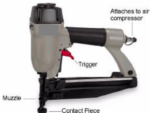
Figure 1: Nail Gun, finish nailer type

A common hazard pattern is accidental firing of a nail into a body part (usually hand or finger) or into another person. Many nail guns are activated by a trigger and a contact piece on the muzzle of the nail gun (see Figure 1). It is common practice to hold the trigger down and simply push the contact piece into the work material to fire a nail. This practice is susceptible to unintentional firing of a nail by accidentally contacting the nailer to a body part or nearby person, or unexpected recoil (backward jerk of a gun when it is fired) of the nail gun that causes contact. Sensitive triggers in conjunction with nailer recoil can also lead to inadvertent firing of an additional nail. This second nail can ricochet off the first nail and cause injury, or miss the work piece entirely to strike a body part or nearby person.