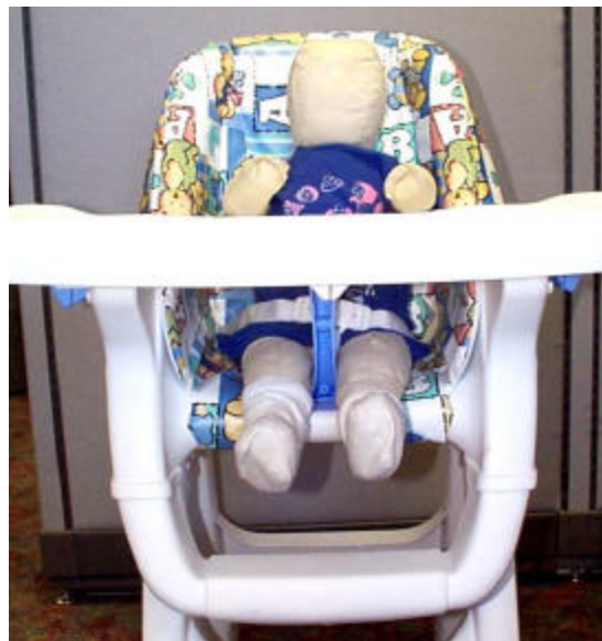
Passive Restraint System

Sometimes, especially with high chairs, there is an added “passive-restraint” which may be a bar or strap from the base of the seat to the bottom of the tray. This passive restraint is designed to prevent the child from exiting the product feet first, but does not keep the child from climbing out of the product.