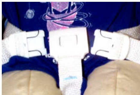
3-Point Restraint Systems