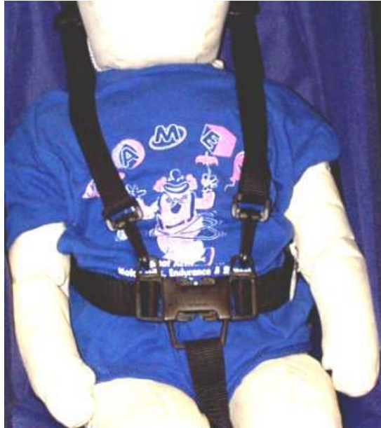
5-Point Restraint System

Sometimes, especially with high chairs, there is an added “passive-restraint” which may be a bar or strap from the base of the seat to the bottom of the tray. This passive restraint is designed to prevent the child from exiting the product feet first, but does not keep the child from climbing out of the product.