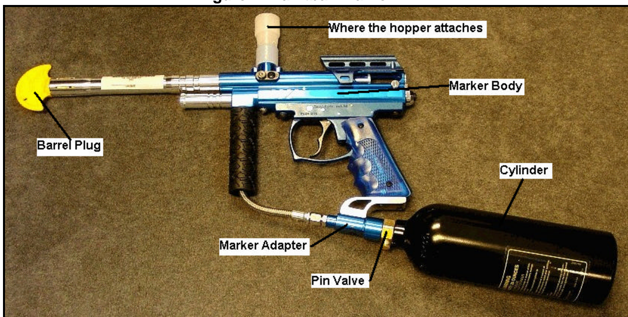
Figure 1: Paintball Marker

A common hazard pattern is intentional or accidental firing of a paintball into a body part (usually face or eye). Paintball markers are activated by a trigger much like BB-guns. A paintball marker consists of the marker body (which looks like a gun), a cylinder (which contains compressed gas for propelling the paintball pellets), and a hopper (which acts as a magazine for holding the paintball pellets) (see Figure 1).