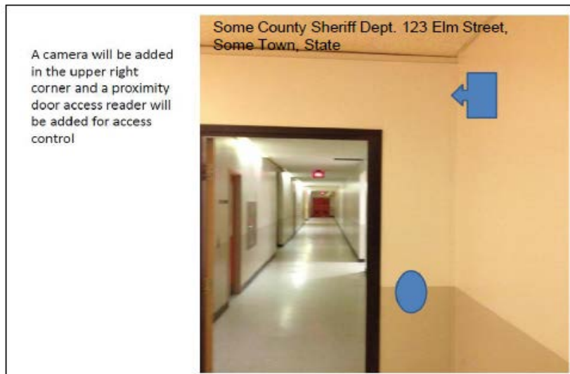
Figure 6. Interior photograph showing proposed location of new equipment.

Interior equipment photographs. The example in Figure 6 shows the use of graphic symbols to represent security features planned for a building. The same symbols are used in the other pictures where the same equipment would be installed at other locations in/on the building. This example includes the name of the facility and its physical address.