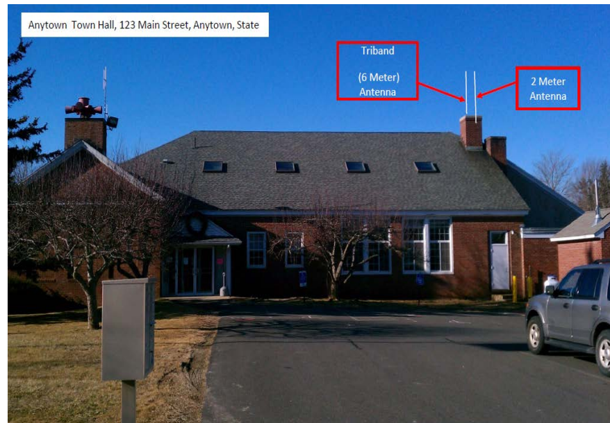
Figure 2. Example of ground-level photograph showing proposed attachment of new equipment

Ground-level photographs. The ground-level photograph in Figure 2 supplements the aerial photograph in Figure 1, above. Combined, they provide a clear understanding of the scope of the project. This photograph has the name and address of the project site, and uses graphics to illustrate where equipment will be installed.