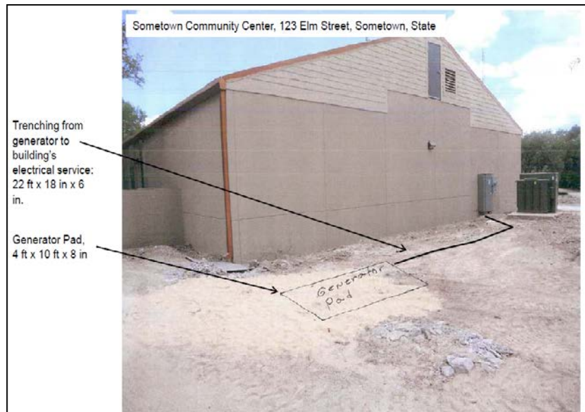
Figure 4. Ground-level photograph showing proposed ground disturbance area.

The example in Figure 4 shows the proposed location for the concrete pad for a generator and the ground disturbance to connect the generator to the building's electrical service. This information can be illustrated with either an aerial or ground-level photograph, or both. This example has the name and physical address of the project site.