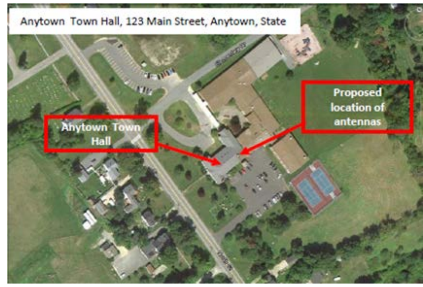
Figure 1. Example of labeled, color aerial photograph.

Aerial Photographs. The example in Figure 1 provides the name of the site, physical address and proposed location for installing new equipment. This example of a labeled aerial photograph provides good context of the surrounding area.