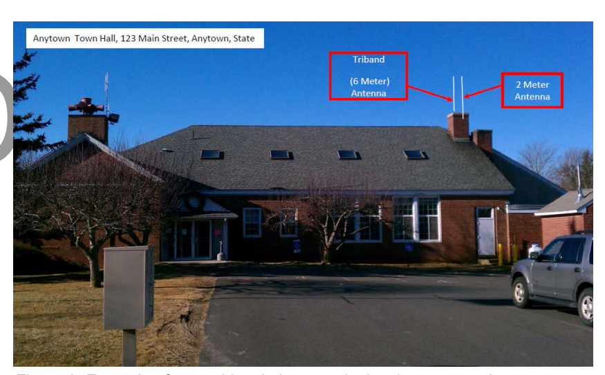
Figure 2. Example of ground-level photograph showing proposed attachment of new equipment.

Ground-level photographs. The ground-level photograph in Figure 2 supplements the aerial photograph in Figure 1, above. Combined, they provide a clear understanding of the scope of the project. This photograph has the name and address of the project site, and uses graphics to illustrate where equipment will be installed.