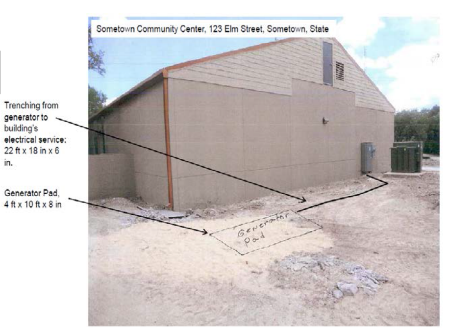
Figure 4. Ground-level photograph showing proposed ground disturbance area.

Ground-level photograph with excavation area close-up. The example in Figure 4 shows the proposed location for the concrete pad for a generator and the ground disturbance to connect the generator to the building's electrical service. This information can be illustrated with either an aerial or ground-level photograph, or both. This example has the name and physical address of the project site.