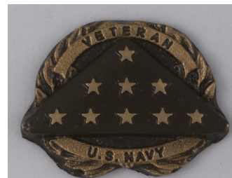
One-and-one-half inch Medallion