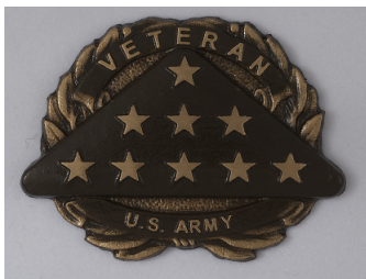
Three inch Medallion