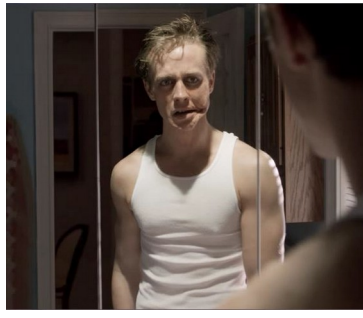
F10_1. How would you describe this advertisement?