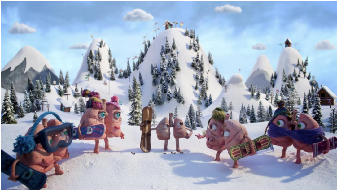
Video 3 : Little Lungs

Link: https://www.youtube.com/watch?v=nEjrjTsVLY4