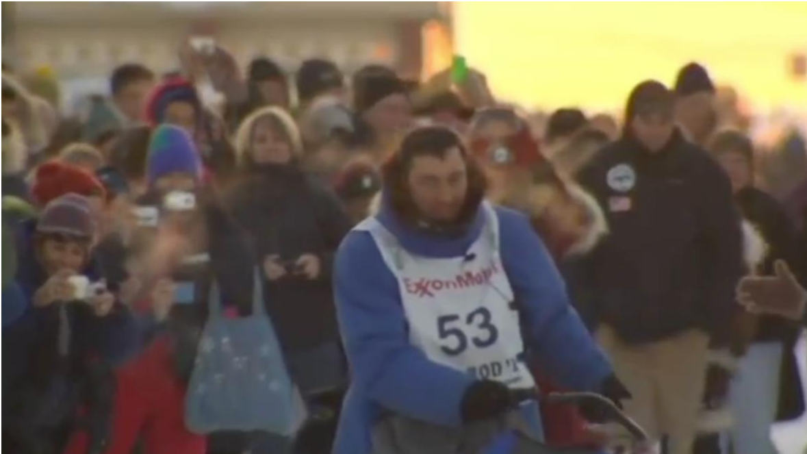
Video 11 : Act on the Trail: Attitude

Link: https://www.youtube.com/watch?v=pwkjuCEm2Qk