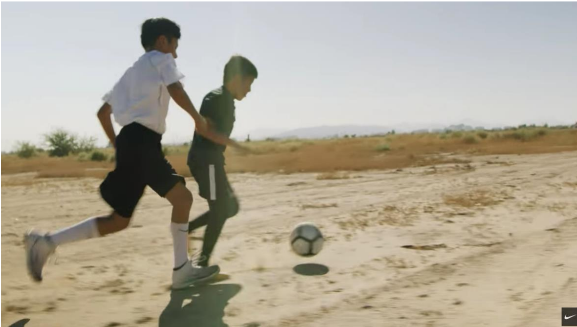
Video 13 : Nike Dare to Rise for Equality

Link: https://www.youtube.com/watch?v=GGVArGfPlsU