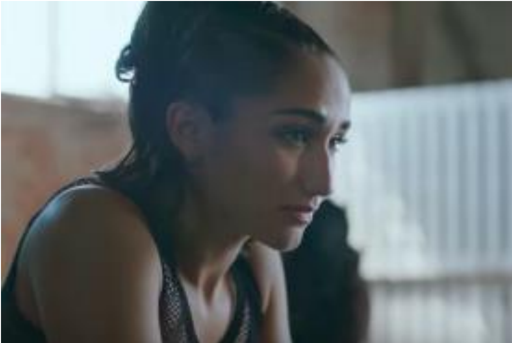
Video 4 : Keep it Moving

Link: https://www.youtube.com/watch?v=ziu2uhE8Dul