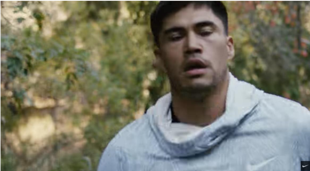
Video 12 : Nike N7 Dare to Rise

Link: https://www.youtube.com/watch?v=KaPzUMeMdvo