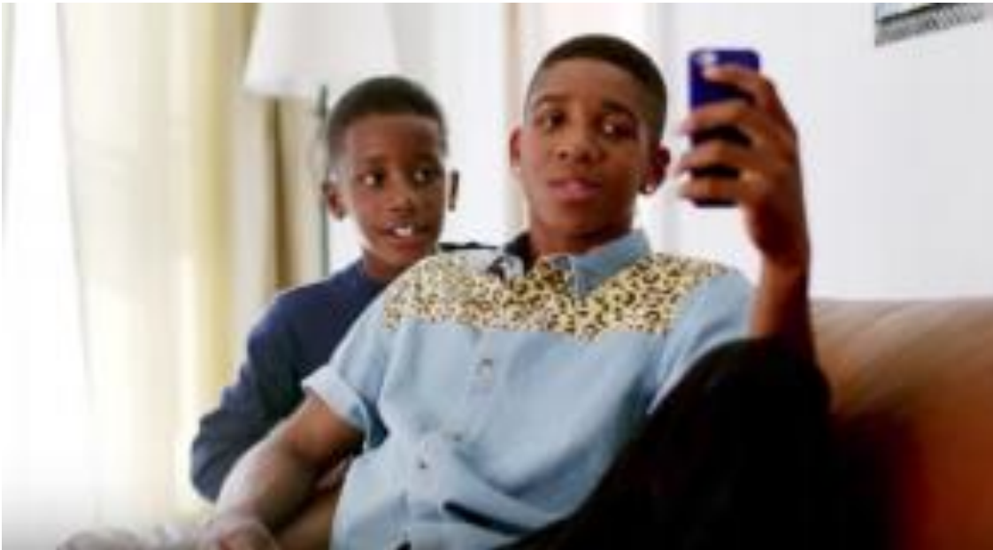
Video 5 : Lil Brother

Link: https://www.youtube.com/watch?v=3pSbBhk6JP8