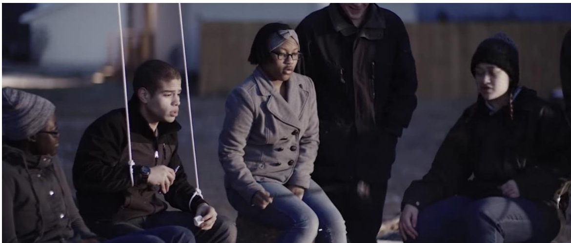
Video 8 : Tobacco Controls

Link: https://www.youtube.com/watch?v=jKxwYKqRh_I