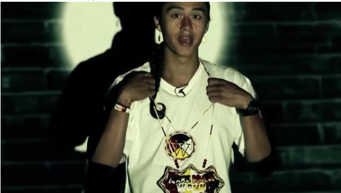
Video 14 : Montana Rapper

Link: https://www.youtube.com/watch?v=v4RE6eyx5Ow