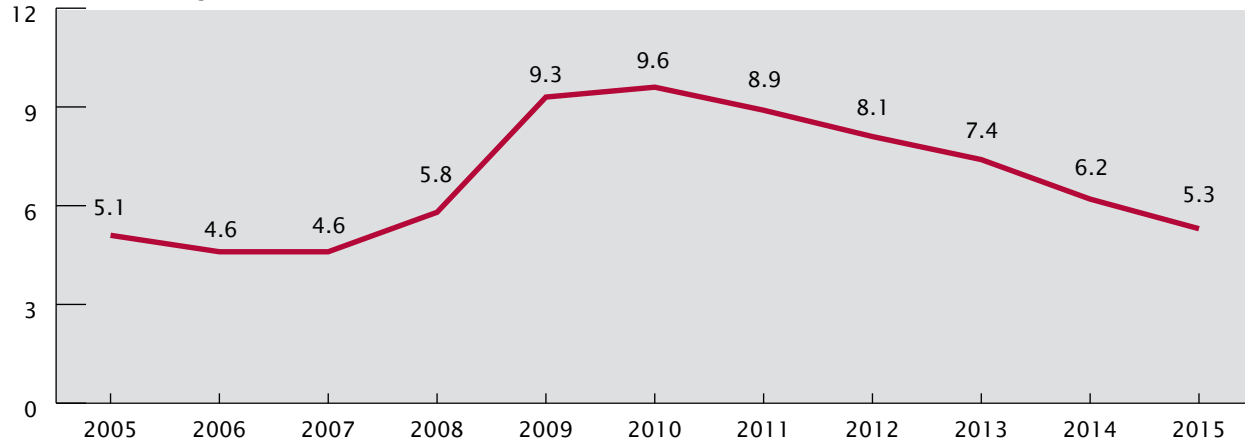
2005 to 2015: Bureau of Labor Statistics.