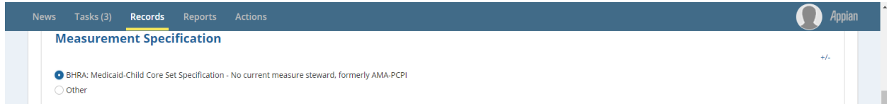
Figure 1: Measurement Specifications – Path 1