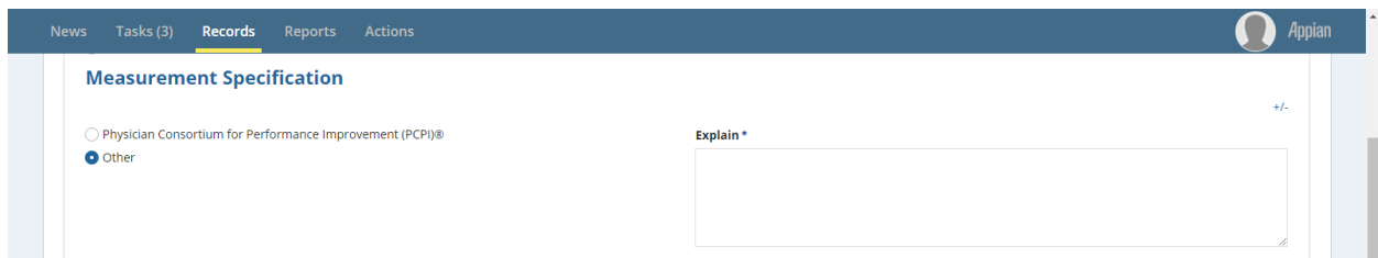
Figure 2: Measurement Specifications – Path 2