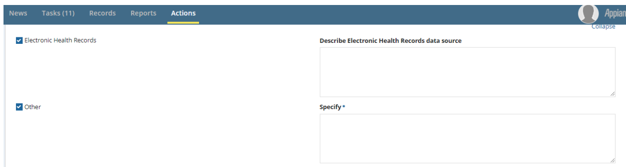
Figure 3: Data Source