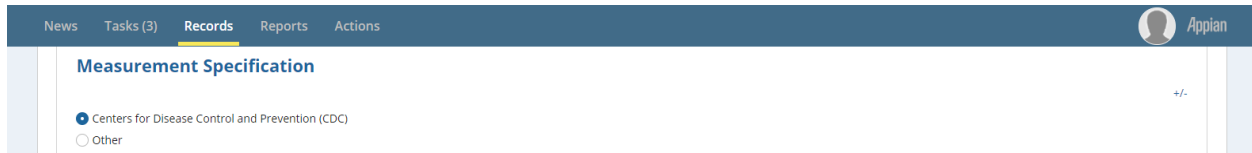
Figure 1: Measurement Specifications – Path 1