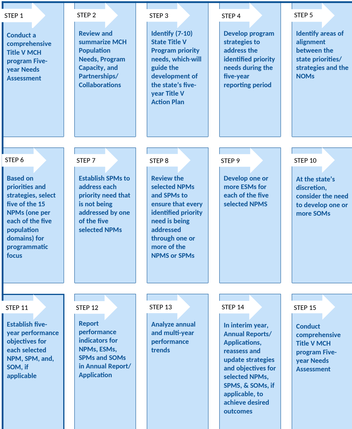
Figure 4. MCH Block Grant Logic Model

The state begins each five-year cycle by conducting a comprehensive Title V Five-Year Needs Assessment. This Needs Assessment includes a comprehensive review of MCH population needs, program capacity, and partnerships/collaborations that are critical components of a state's system of care for addressing the needs of its MCH population.