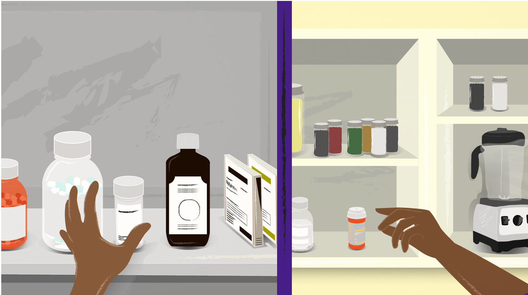
NARRATOR: Unused or expired medicines may be hiding right in your home. In bathrooms, kitchens...