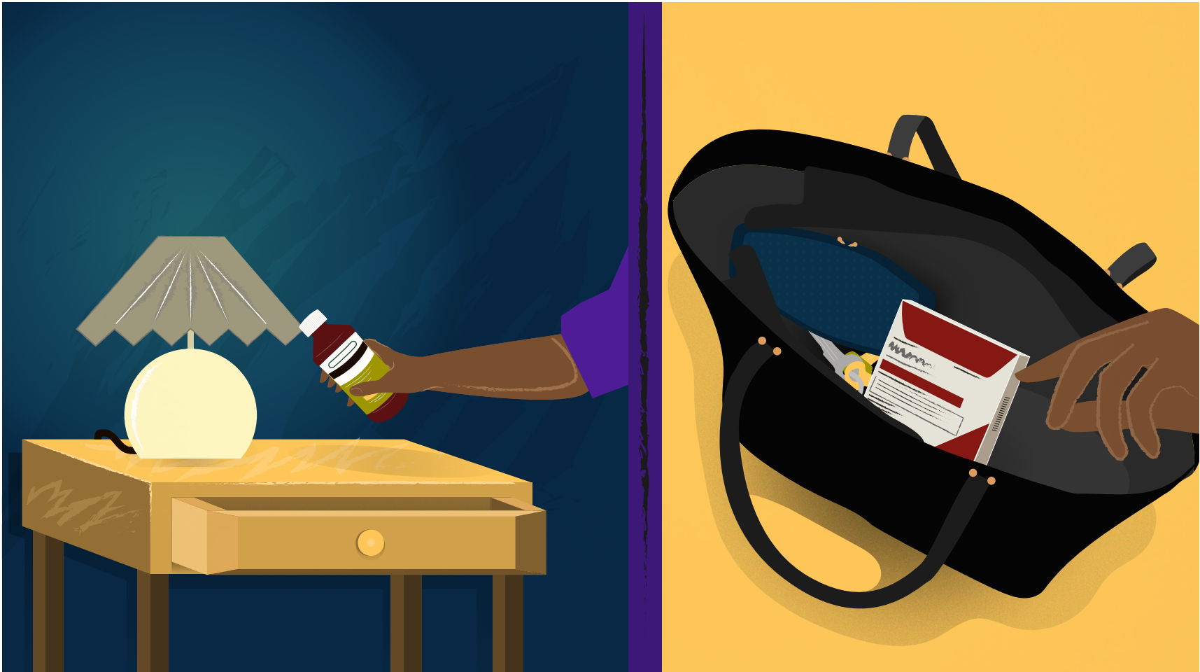
NARRATOR: ... bedrooms, purses, and anywhere you store medicines.