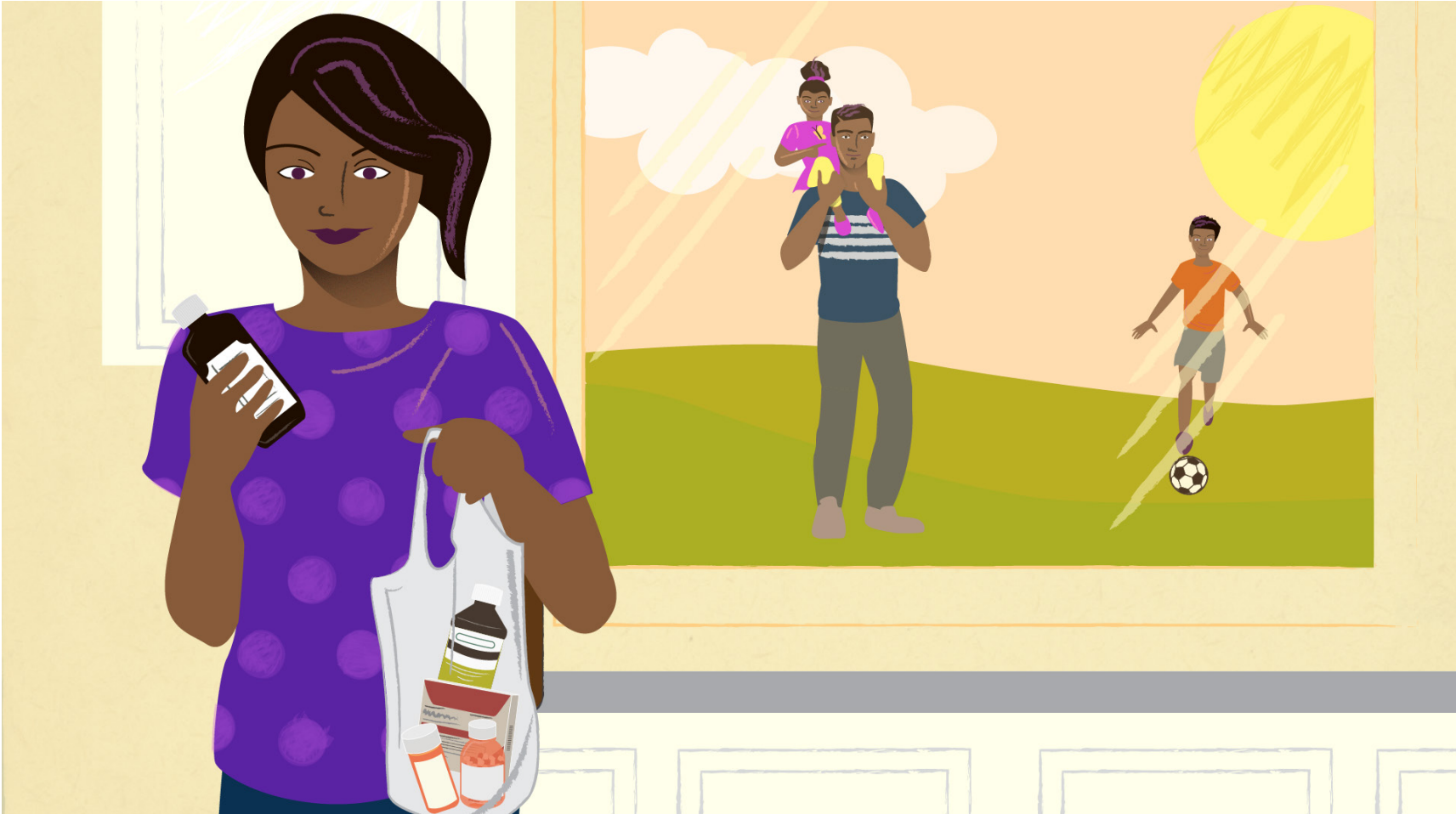
NARRATOR: Why put your family at risk? Safely dispose of opioids before they can do harm.