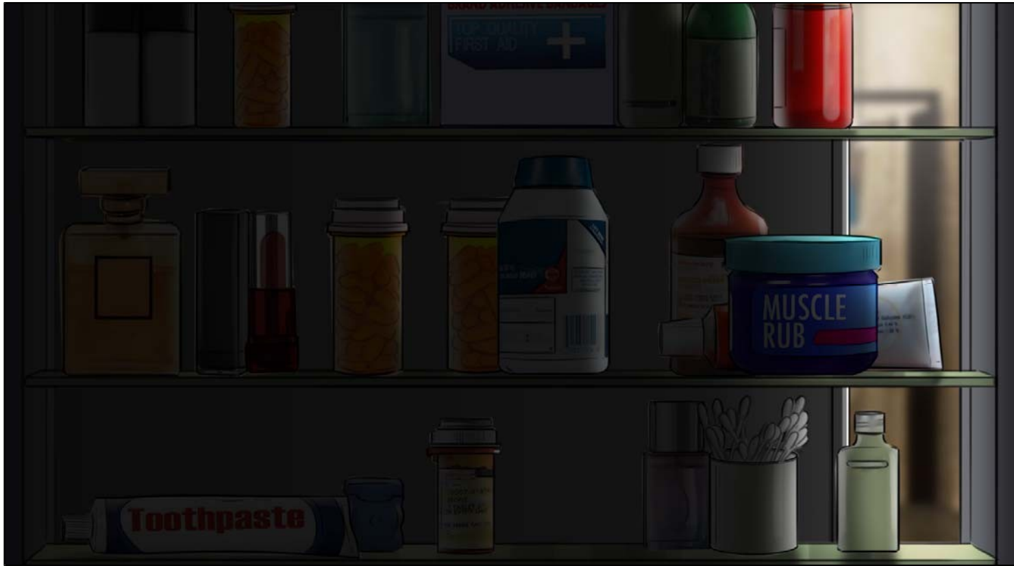
Medicine cabinet door closes (screen goes black for a split second).