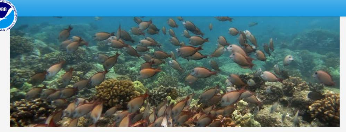
Hawaii Reef Diving and Snorkeling Expenses Survey