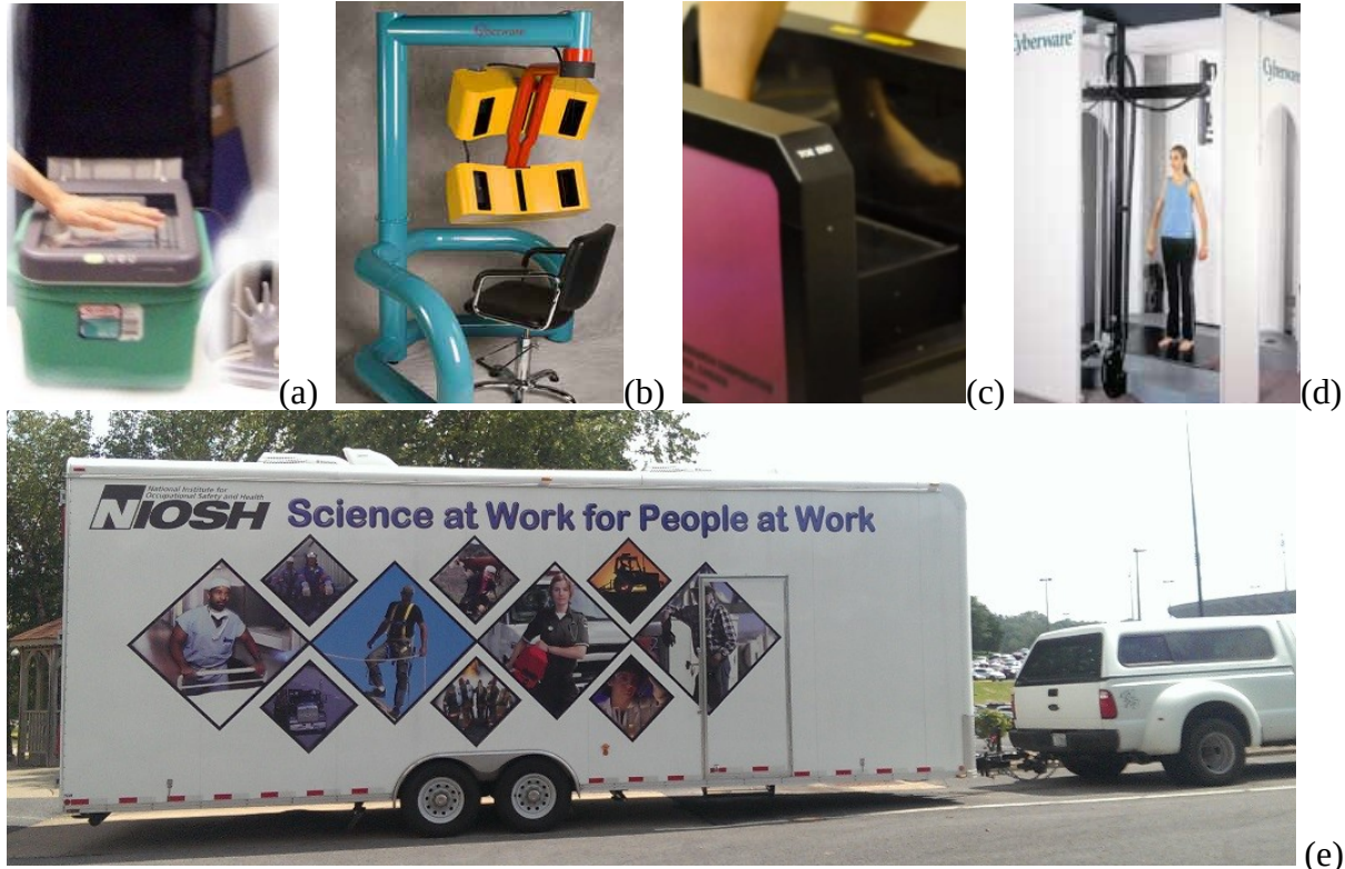
Figure 1: (a) hand scanner, (b) face & head scanner, (c) foot scanner, and (d) whole-body scanner to be used in the study. They are housed in a mobile anthropometry lab in a truck trailer (e).

A hand scanner, a head scanner, a foot scanner, and a whole body scanner, housed in a trailer, are used for 2D and 3D body shape registering (Figure 1).