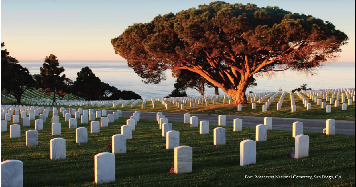
Fort Rosecrans National Cemetery, San Diego, CA