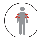
CLAMMY OR SWEATY SKIN