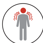
FEVER, OR SHIVERING, OR FEELING VERY COLD