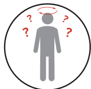
CONFUSION OR DISORIENTATION

Signs and symptoms of sepsis can include any one or a combination of the following: