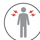
EXTREME PAIN OR DISCOMFORT