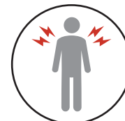
EXTREME PAIN OR DISCOMFORT