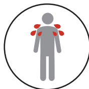
CLAMMY OR SWEATY SKIN

To learn more about sepsis and how to prevent infections, visit www.cdc.gov/sepsis .