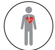
HIGH HEART RATE