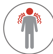
FEVER, OR SHIVERING, OR FEELING VERY COLD