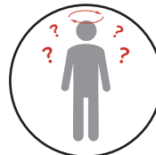
CONFUSION OR DISORIENTATION