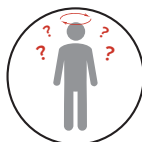
CONFUSION OR DISORIENTATION