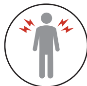
EXTREME PAIN OR DISCOMFORT