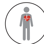
HIGH HEART RATE