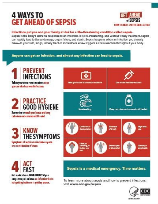
Four Ways to Get Ahead of Sepsis [1 page]

Programmer: FOR POST-TEST ONLY - For Q62, proceed to Q63 regardless of answer choice (screen grab of below material and Q63 should be on one page)