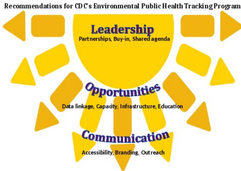
Figure 4. Illustration of workshop recommendations.

Figure 4 adapts the sun imagery of the Tracking Program logo to illustrate key messages of the recommendations. From a central core of strong leadership numerous opportunities can be developed to enhance the Tracking Program. Implementation of each opportunity represents a chance to communicate information, actions and successes with the ultimate goal of improved public health.