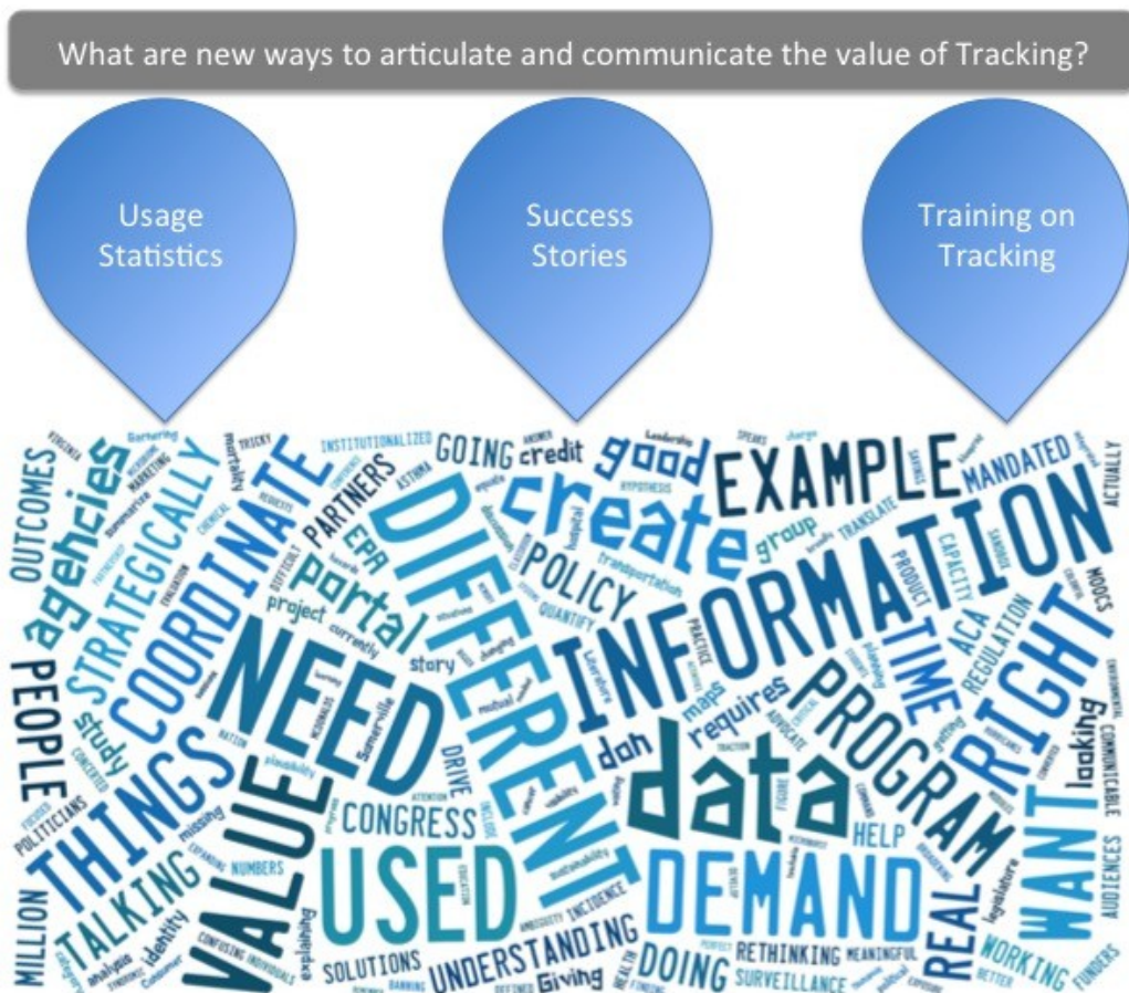
Figure 3: Concepts discussed in response to Discussion Prompt 3 3

Tracking could benefit from an Institute of Medicine report to establish it in the field as a valuable tool for scientific use. Through such an IOM report, it could become a core component in environmental public health. In addition to this, partnering with educational institutions will help to facilitate uptake of Tracking data usage, as the workforce will increasingly be trained in its capabilities and applications. Furthermore, these suggestions provide opportunities for the Tracking Program to solicit feedback from a wide range of environmental public health professionals on how best to strategically increase the scope of the program.