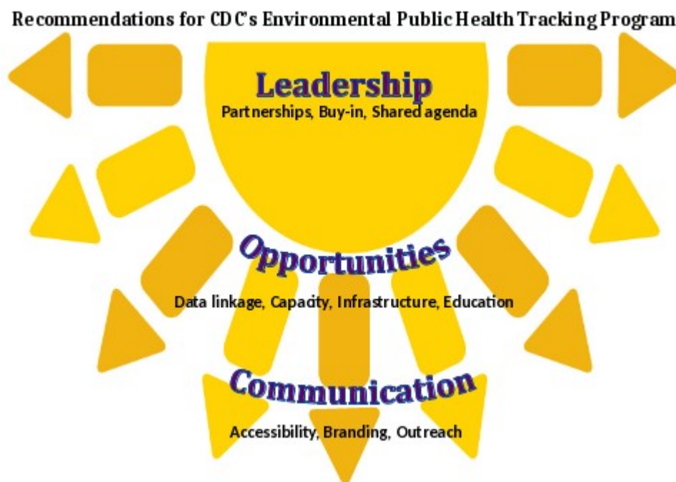
Figure ES-1. Illustration of workshop recommendations

Figure ES-1 adapts the Tracking Program logo to illustrate the key messages reflected in the expert panel’s recommendations. From a strong leadership core, numerous opportunities can be developed to enhance the Tracking Program. Each opportunity, in turn, represents a chance to communicate public health information, actions and success stories with the ultimate goal of improving public health.