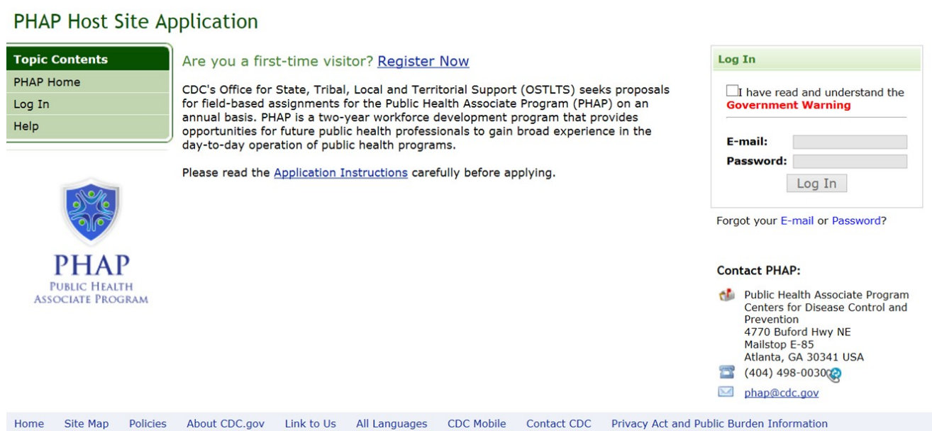
Figure 2.1-b. Privacy Act and Public Burden Information