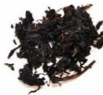
Chewing Tobacco (Plug)