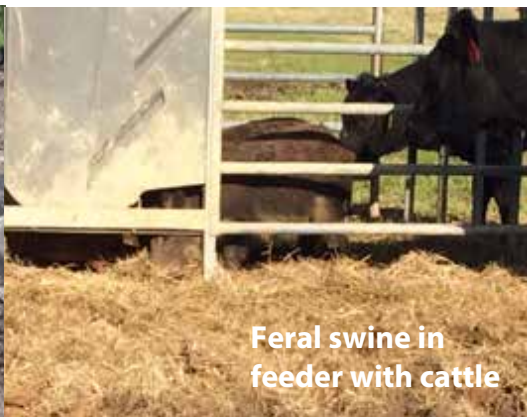
Feral swine in feeder with cattle