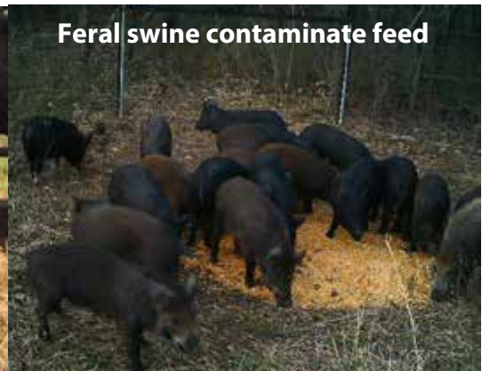
Feral swine contaminate feed