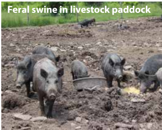
Feral swine in livestock paddock