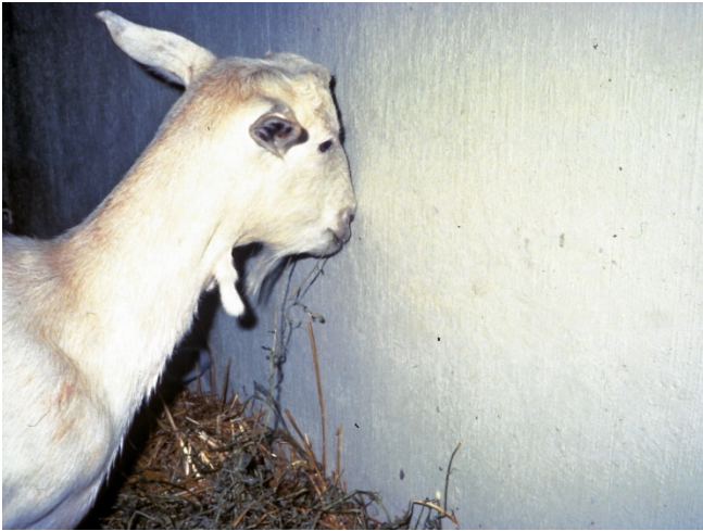
Head pressing is a common behavior in kids affected by encephalomyelitis caused by the CAE.