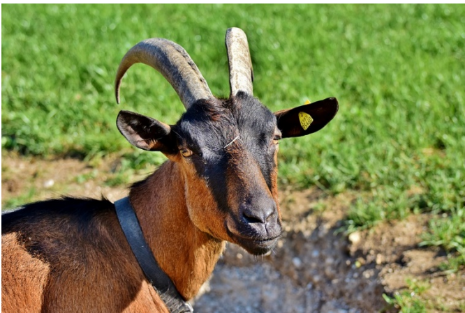
Goats test-positive for CAE might appear healthy, and some might never develop the severe clinical signs attributed to the disease.

Caprine arthritis encephalitis (CAE) is a viral disease of goats. The virus that causes CAE is one of several small ruminant lentiviruses in the family Retroviridae . Retroviruses cause chronic viral infections in many vertebrate species, e.g., HIV in humans. Infection occurs when the viral genome is inserted into an animal's DNA, producing new viral particles with the host's cellular machinery and infecting tissue macrophages, which can establish infection in multiple organs and evade the goat's immune system. This mechanism allows the virus to persist for the life of the animal. CAE might cause one or more of the following clinical signs: arthritis, pneumonia, mastitis, as well as weight loss in goats and encephalitis in kids.