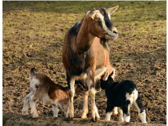
Transmission of the CAE virus through colostrum and milk is the most common route of transmission.

Live-animal trade is thought to be a major risk factor for CAE virus transmission from one herd to another. 5, 6, 7 The live-animal trade is also a primary contributor of disease dispersion in large geographical regions. During early investigations of CAE virus prevalence in Mexico, officials found that many infected goats had been imported from the United States, while Mexico's indigenous Criollo goats were not infected.