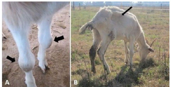
Clinical presentation of arthritis due to CAE infection, causing swollen knee joints, weight loss, and paralysis of the affected limbs.

Infected animals also lose body condition and develop a rough coat. In addition, labored breathing due to pneumonia might be present in mature goats and in kids. Other clinical signs of CAE include indurative mastitis, a hardening of the udder caused by an infected animal's immune response to the virus. Animals with indurative mastitis usually have low or nonexistent milk production. Additionally, weight loss is one of the most common signs of CAE infection in herds. 8