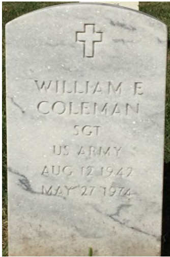
UPRIGHT HEADSTONE WHITE MARBLE (U) OR LIGHT GRAY GRANITE (V)

This headstone is 42 inches long, 13 inches wide and 4 inches thick. Weight is approximately 230 pounds. Variations may occur in stone color, and the marble may contain light to moderate veining.