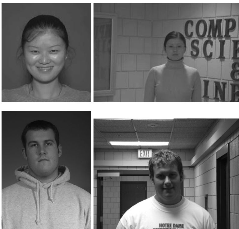
Fig. 1. Example of controlled (left) and uncontrolled (right) illumination images.

uncontrolled illumination images. This yields a matrix of similarity scores where element s_{i,j} of the matrix contains the similarity between the i^{\text{th}} controlled illumination image and the j^{\text{th}} uncontrolled illumination image. The source data for Experiment 1 were based on each algorithms' matrix of similarity scores for all available East Asian face pairs age 18 to 35 ( n = 205,114 ; 4,858 match pairs and 200,256 nonmatch pairs) and all available Caucasian face pairs age 18 to 35 ( n = 3,359,404 ; 13,812 match pairs and 3,345,592 nonmatch pairs). These scores were extracted from the similarity score matrix computed by each algorithm for the FRVT 2006.