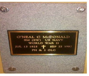
This niche marker is 8-1/2 inches long, 5-1/2 inches wide, with 7/16 inch rise. Weight is approximately 3 pounds; mounting bolts and washers are furnished with the marker. Used for columbarium or mausoleum interment. Also provided to supplement a privately-purchased headstone or marker for eligible Veterans who died on or after November 1, 1990 and are buried in a private cemetery.