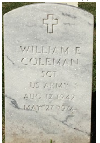
This headstone is 42 inches long, 13 inches wide and 4 inches thick. Weight is approximately 230 pounds. Variations may occur in stone color, and the marble may contain light to moderate veining.

UPRIGHT HEADSTONE WHITE MARBLE (U) OR LIGHT GRAY GRANITE (V)