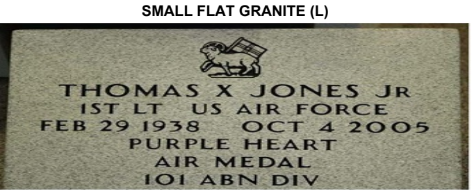
This grave marker is 18 inches long, 12 inches wide, and 3 inches thick. Weight is approximately 70 pounds. Variations may occur in stone color.

This grave marker is 24 inches long, 12 inches wide, and 4 inches thick. Weight is approximately 130 pounds. Variations may occur in stone color; the marble may contain light to moderate veining.