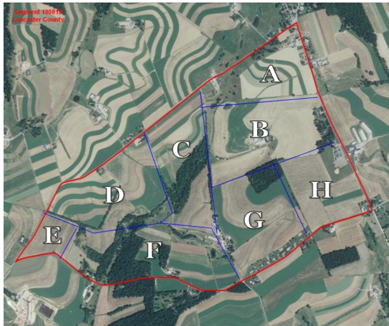
Figure 2: JAS Segment (outlined in red) and Tract Boundaries (outlined in blue)

The area frame is a theoretically complete sampling frame with every acre of land having a known probability of selection. As such, it is used to estimate the number of farms and land in farms independently of the list frame. The area frame also provides a measure of incompleteness in the list. The JAS uses a replicated sample design. A sample rotation scheme is used to reduce respondent burden caused by repeated interviewing and to avoid the expense of selecting a completely new area sample each year. Once selected, a segment stays in the sample for five years, so that annually, approximately 20 percent of the sampled segments in each land-use stratum are replaced with newly selected segments in each land-use stratum. Full descriptions of the JAS design and analysis procedures may be found in Davies (2009) and Lamas et al. (2011), respectively.