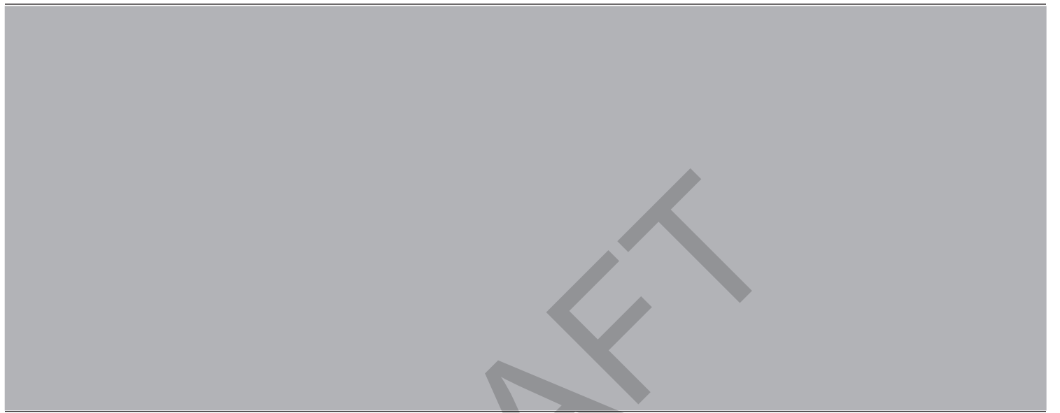
Important Information for Currently Registered Firearms

If you are the current registrant of the firearm described on this form, please note the following information.